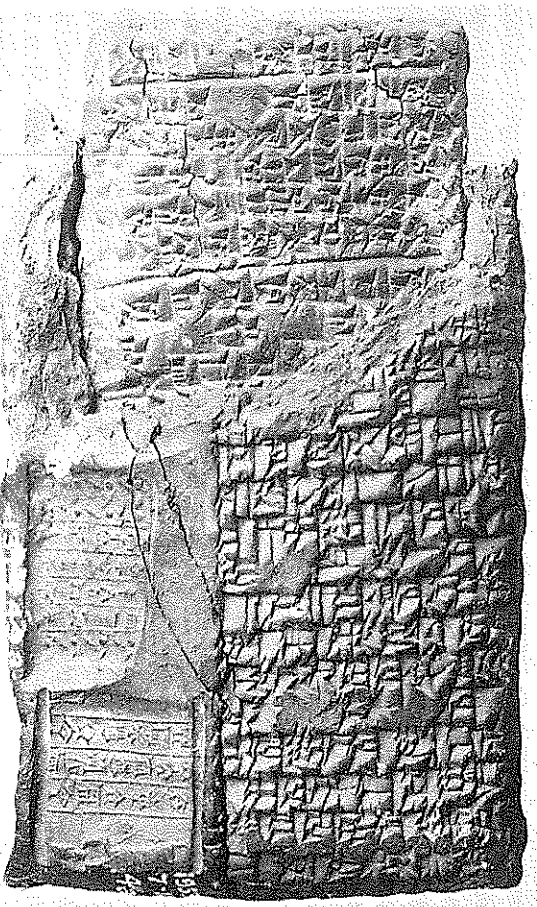
Clay tablet and envelope, later Persian period. Royal Ontario Museum.

Scribes kept the voluminous accounts of the temples and recorded the details of regulations in priestly courts. Practically every act of civil life was a matter of law which was recorded and confirmed by the seals of contracting parties and witnesses. In each city, decisions of the courts became the basis of civil law. The growth of temples and extension in power of the cult enhanced the power and authority of priests. The characteristics of clay favoured the conventionalization of writing, decentralization of cities, the growth of continuing organization in the temples, and religious control. Abstraction was furthered by the necessity of keeping accounts and the use of mathematics, particularly in trade between communities.