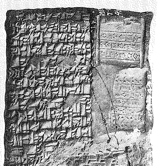
an period. Royal Ontario Museum.