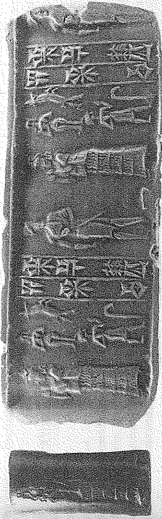
Old Babylonian period cylinder seal and its impression. Royal Ontario Museum.

Alluvial clay found in Babylonia and Assyria was used for the making of brick and as a medium in writing. Modern discoveries of large numbers of records facilitate a description of important characteristics of Sumerian and later civilizations, but they may reflect a bias incidental to the character